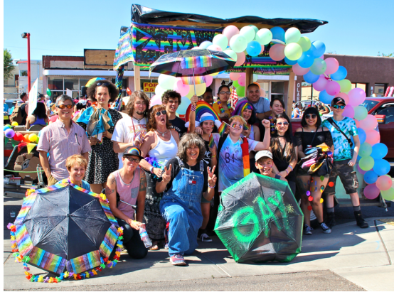
U-21 students and facilitators at 2017 Pride Fiesta.

The kids all had a great time decorating the float for Albuquerque's Pride Fiesta, marching in the parade and celebrating diversity with the rest of our LGBT community at the New Mexico State Fair Grounds.