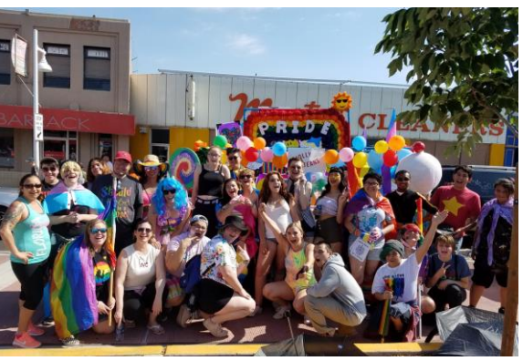
U-21 students and facilitators at the Albuquerque Pride Parade. (June 8<sup>th</sup> 2019)

The youth participants all had a great time decorating the float for Albuquerque's Pride Fiesta, marching in the parade and celebrating diversity with the rest of our LGBT community at the New Mexico State Fair Grounds.